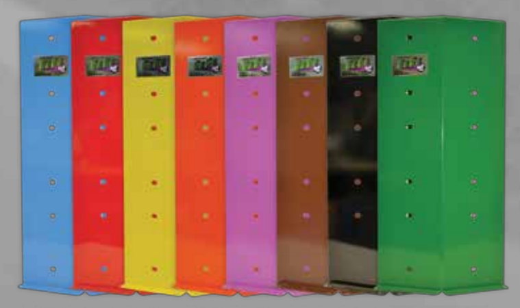
Our Octagon 30H brackets come in a variety of color options!

Purchase your natural wood separately and locally. Or custom order the Structural Composite Lumber option. All 30H models include Cut-Out templates and Instructions and available upon request for 24H models. Cut-Out templates and Instructions are included in all 30H models and available upon request for 24H models.